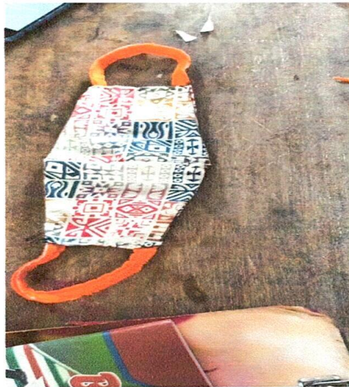
Mask prepared by students